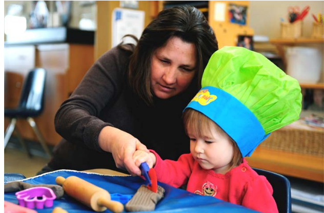
Playing it up.

The program also offers children a direct opportunity to play with others and learn how to take part in structured activities like circle time.